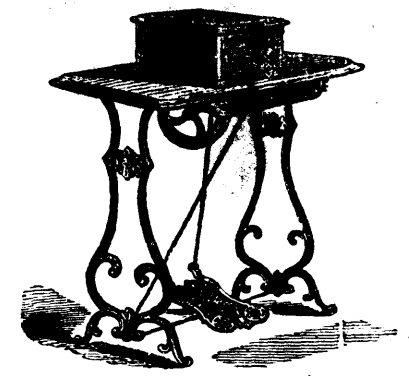
Casket Machine, Complete. Price $30.00.

The above cuts show the style of two of our LOW PRICE DOUBLE-THREAD MACHINES, which we can strongly recommend for all kinds of family purposes, as being equal to any Machine ever made. In addition to the above, we also build the following popular styles of Sewing Machines for Family and Manufacturing purposes:—