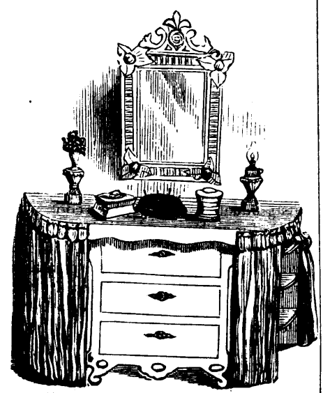
Fig. 1.-BUREAU WITH EXTENSIONS.

It sometimes happens that one bureau affords too scanty accommodation, and the room will not admit of two bureaus. We give here illustrations of the manner in which a lady, who found herself so situated, overcame the diffi-