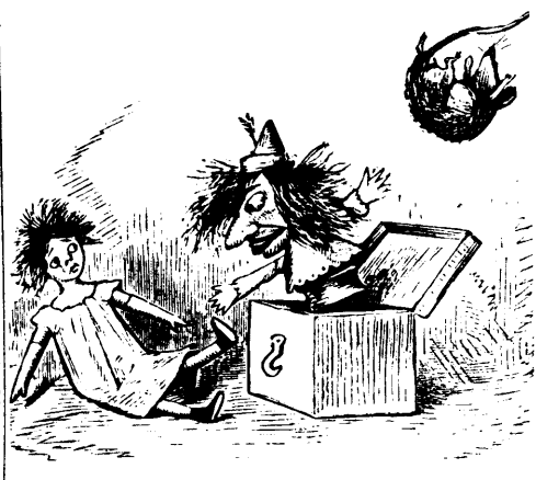
BUT IT WASN'T.