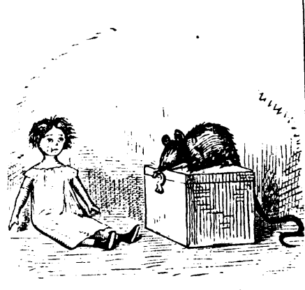
I WONDER WHAT'S IN HERE !-LIKE CHEESE.