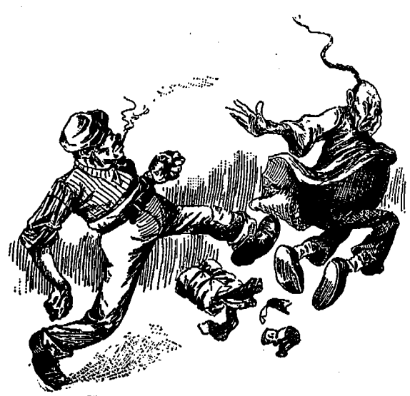
CHINA DECORATED AND FIRED.