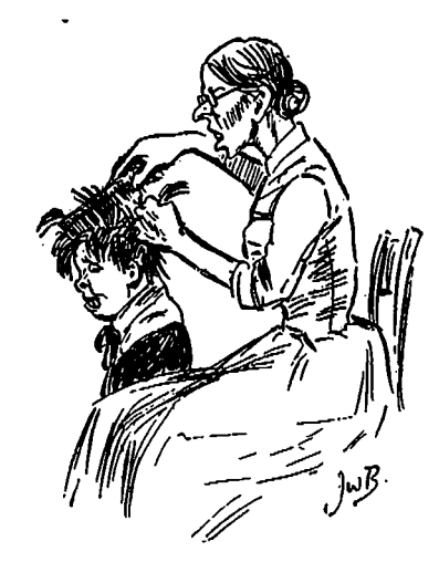
"'TIS HARD TO PART!"