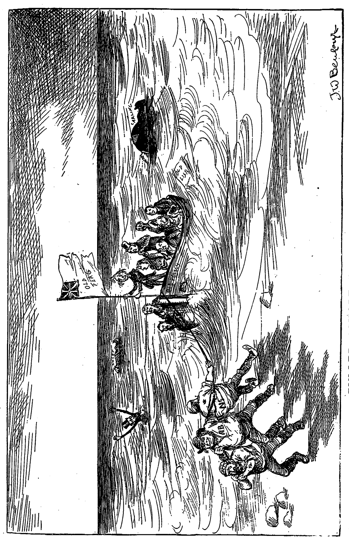
RESCUE OF THE GOVERNMENT YAWL AFTER THE GREAT STORM OF MARCH 5TH. BY THE FISHERMEN PULLED ASHORE