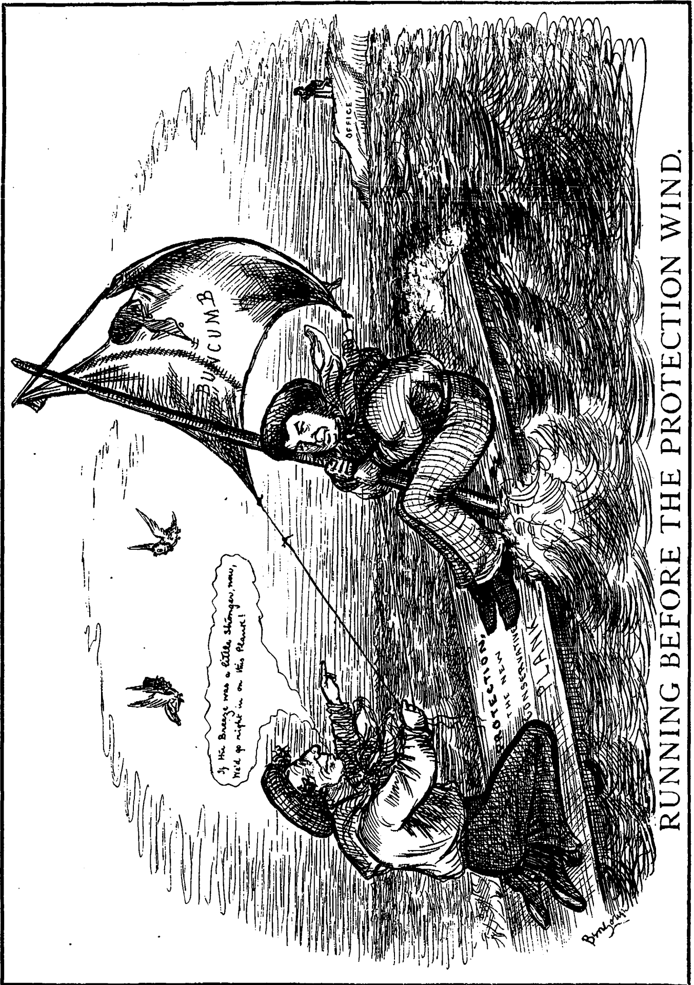
RUNNING BEFORE THE PROTECTION WIND.