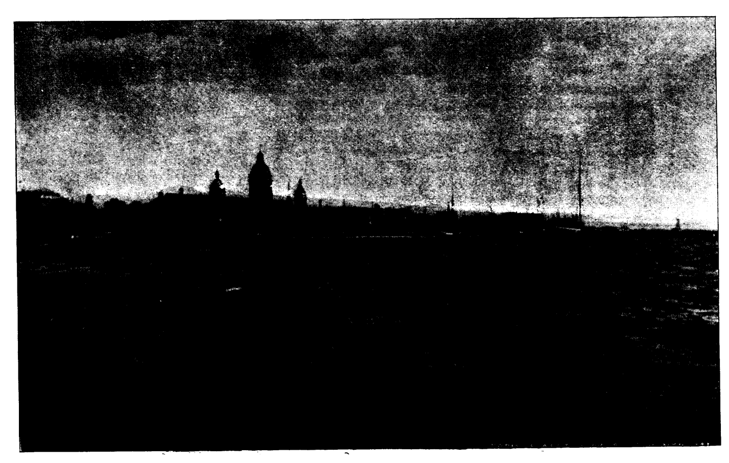
TORONTO HARBOUR, FROM THE WATERWORKS.