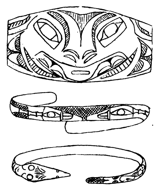
INDIAN SILVER BRACELETS FROM ALASKA.

The natives all belong to a single great tribe, called the Thinket. They might be called the artistic savages of the world. In front of their log houses they erect "totem poles," which are merely logs on end deeply carved with the heraldic designs and house pothing designs of their different families, and have nothing to do with their religion. Every utensil they have is sculptured with some diabolical but well executed decimals. design, and the pretty silver bracelets they make out of American dollars are much coveted by