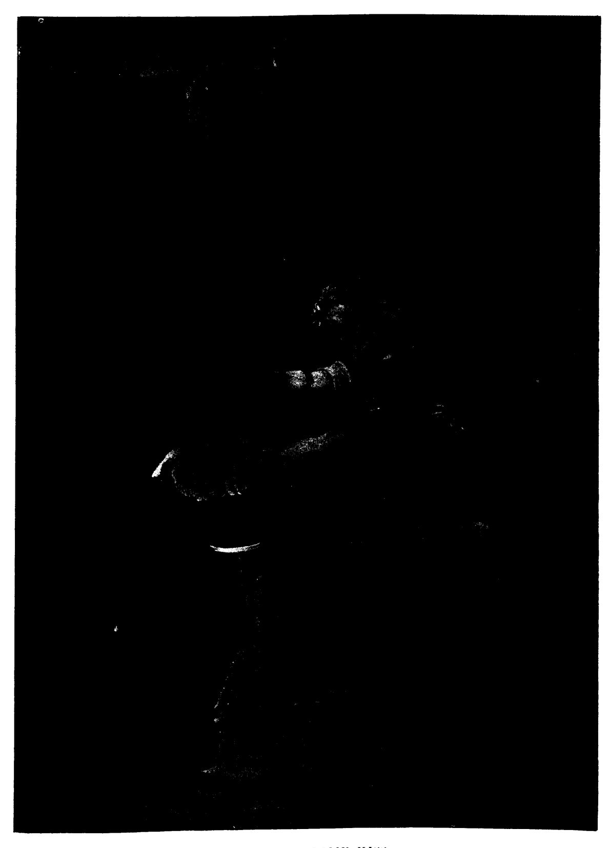
THE UNWELCOME KISS.