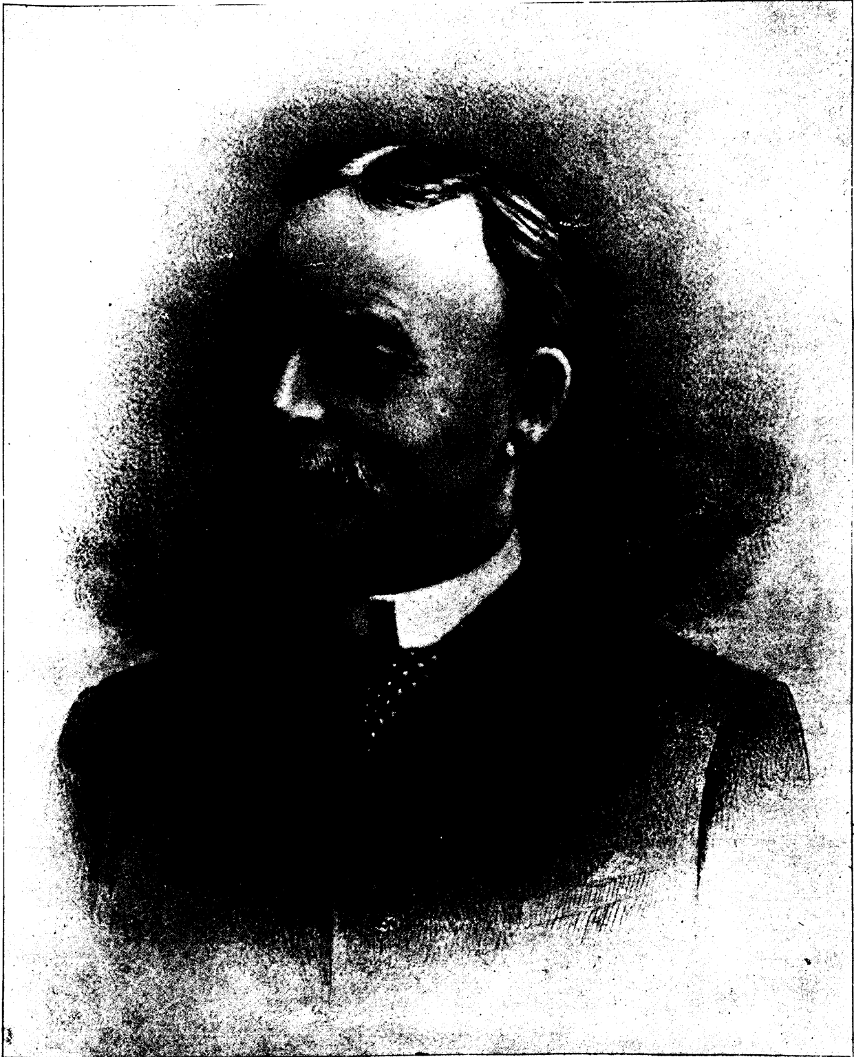
HON. GEO. A. DRUMMOND.