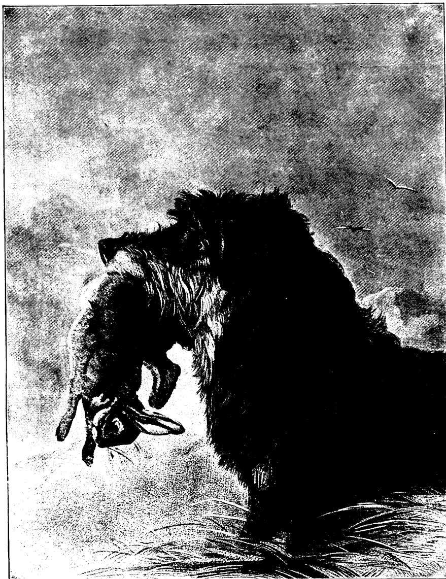
RETRIEVER AND RABBIT.

Yankee Doodle comes to town, Possessed of many a "pony;" Bringing his lovely daughter with A view to Ma tri-mo-ny. Yankee doodle-doodle-doo! The dollars come in handy, Even to Dooks who have too few But know the Ars Amandi . Yankee Doodle rails at rank, That is for home consumption; But at swell relatives the Yank Don't kick—he's too much gumption. Yankee doodle-doodle-doo! Love is sweet as candy, His daughters "reckon" blood that's blue Scarce spoils the British dandy.