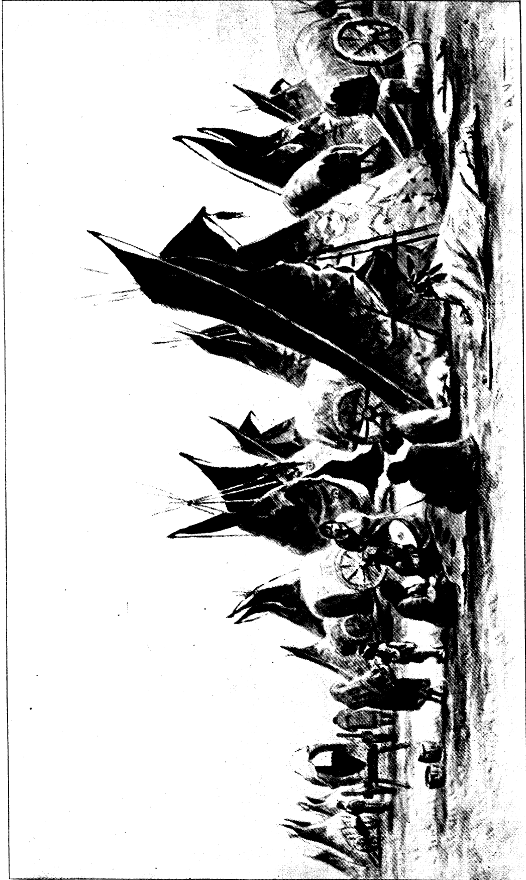
ENCAMPMENT OF BLACKFEET INDIANS.