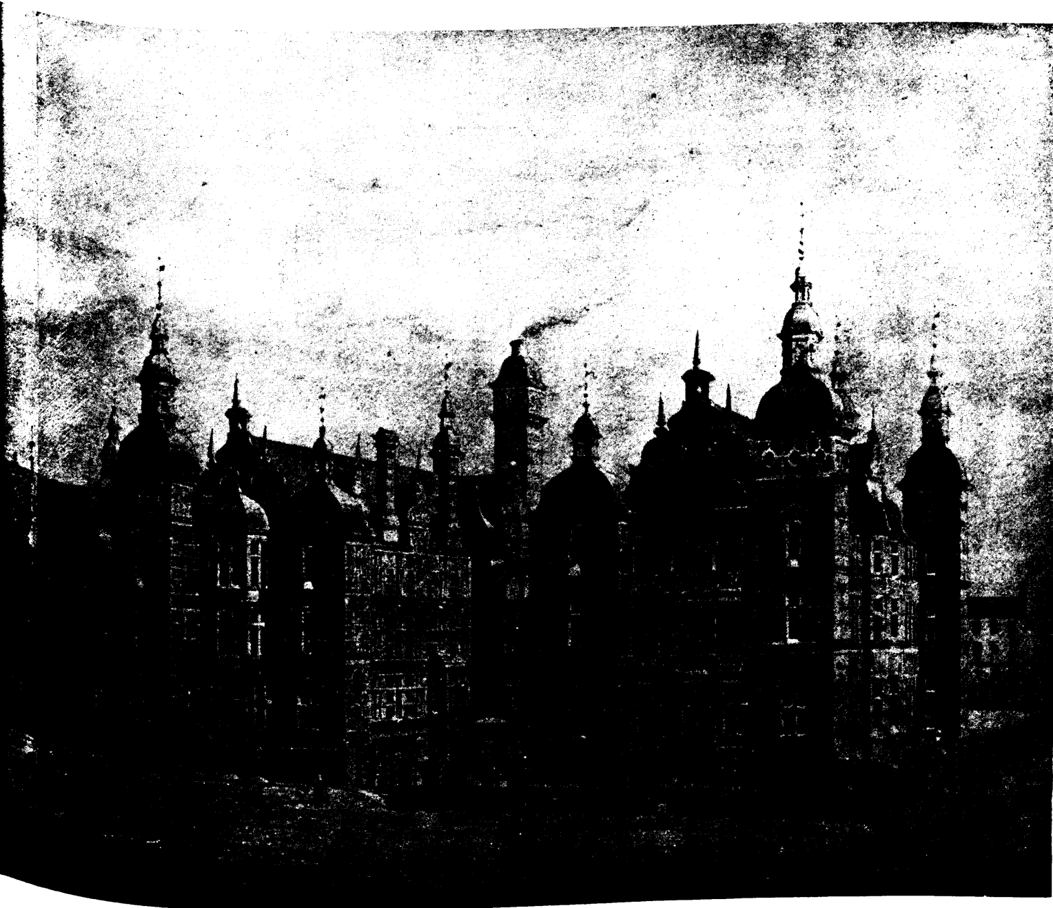
F THE MONTREAL GENERAL HOSPITAL.