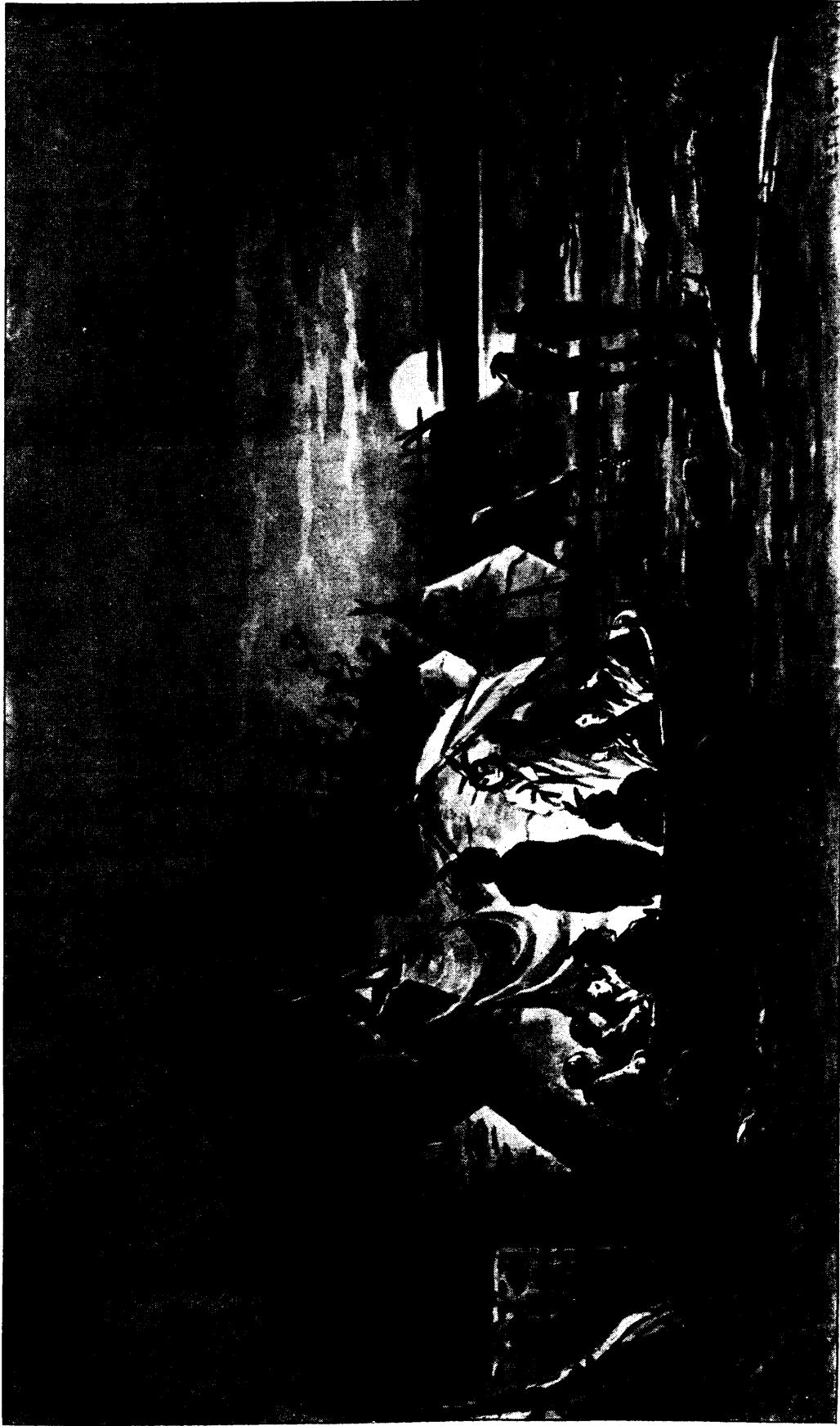
WORSHIP OF MANITOU, LAKE OF THE WOODS.