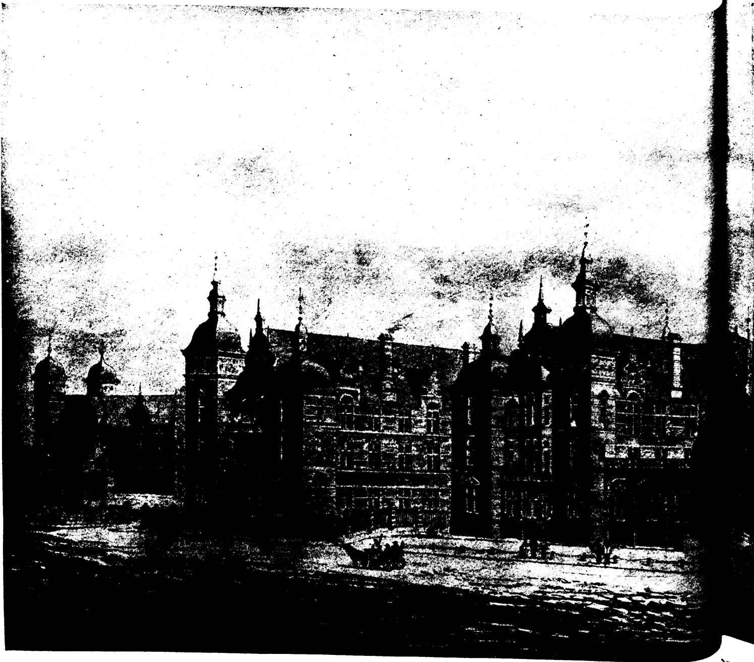
DESIGN FOR THE NEW BUILDING OF THE