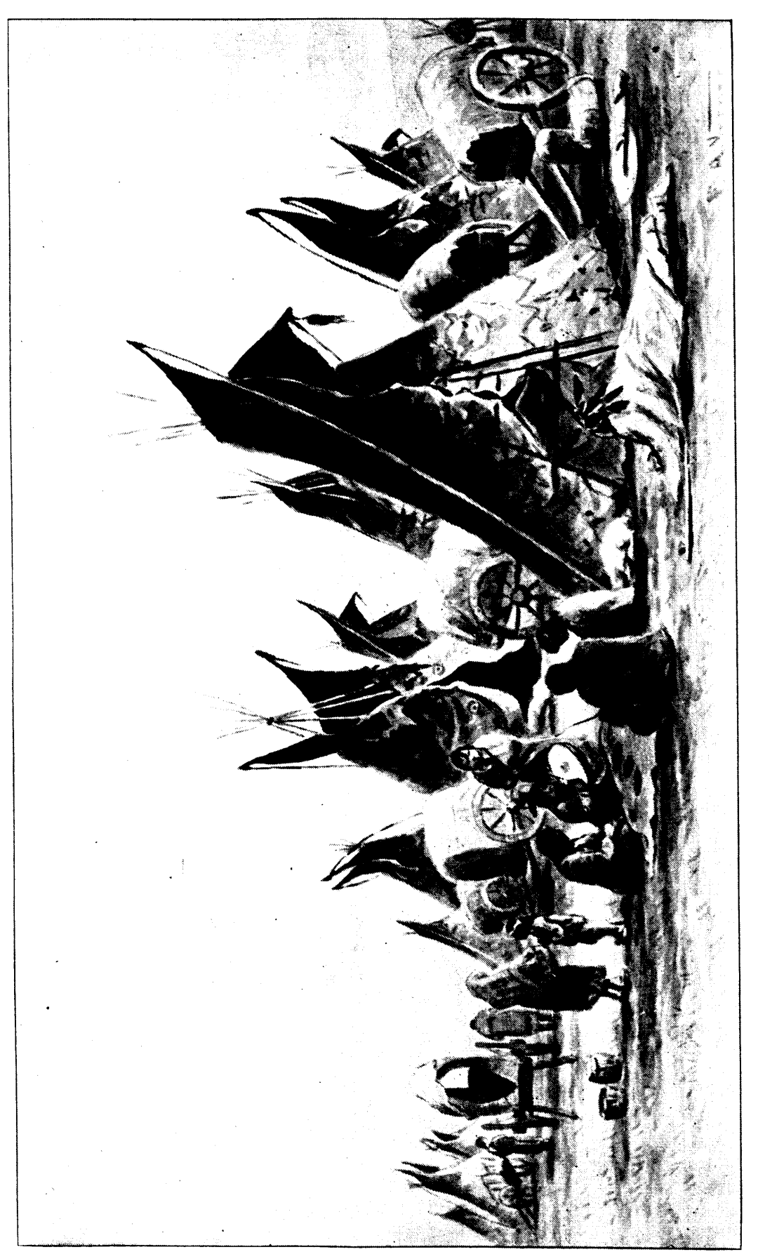
ENCAMPMENT OF BLACKFEET INDIANS.