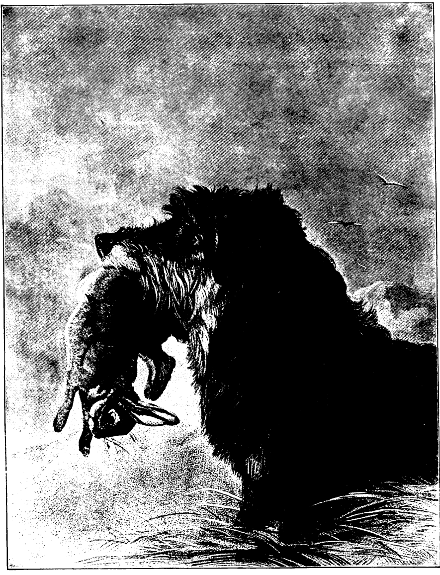
RETRIEVER AND RABBIT.

Vankee Doodle rails at rank, That is for home consumption; But at swell relatives the Yank Don't kick--he's too much gumption. Yankee doodle-dood! Love is sweet as candy, His daughters "reckon" blood that's blue Scarce spoils the British dandy.