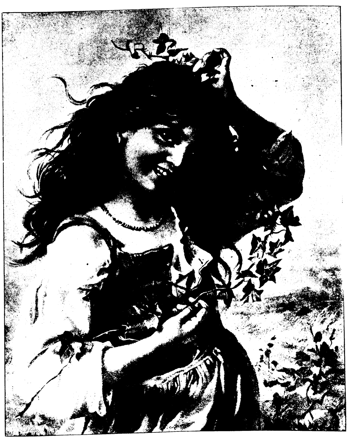
THE YOUNG GYPSY.