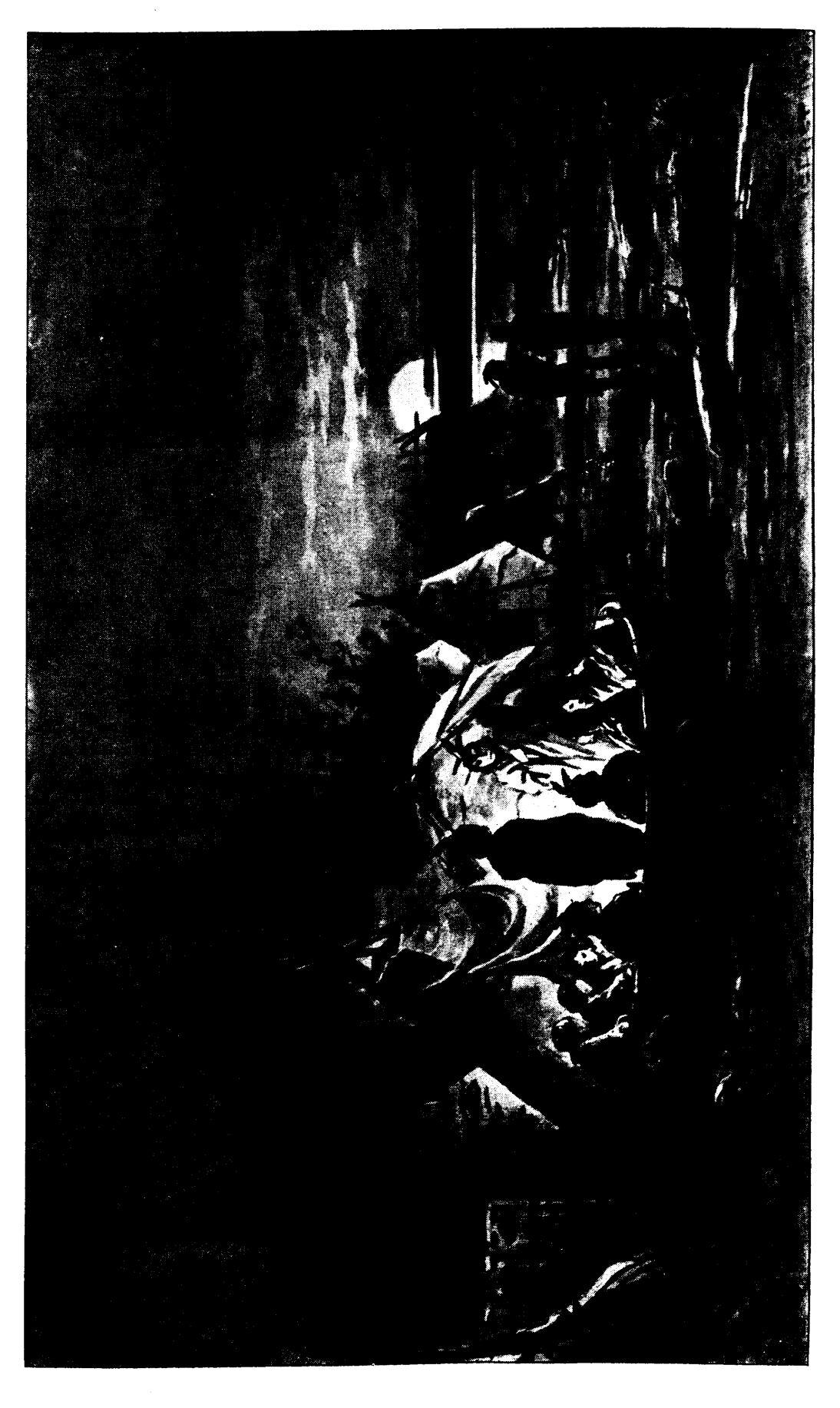
WORSHIP OF MANITOU, LAKE OF THE WOODS.