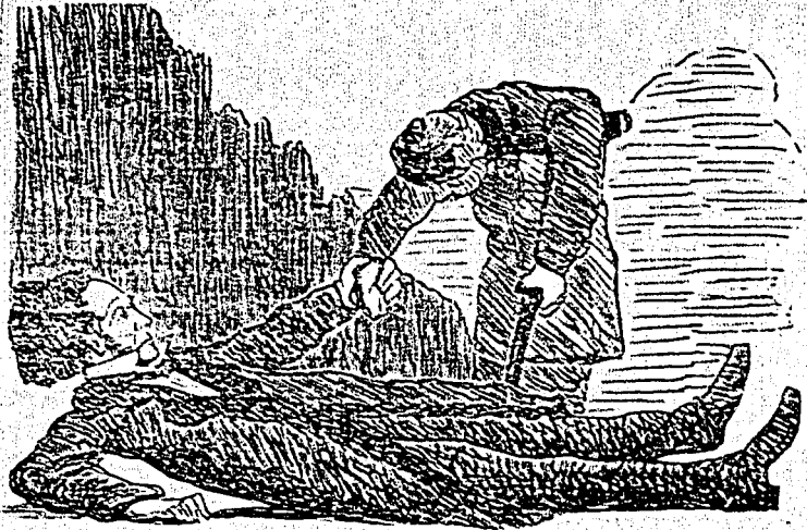
A RECENT SCENE IN ST. PAUL STREET.