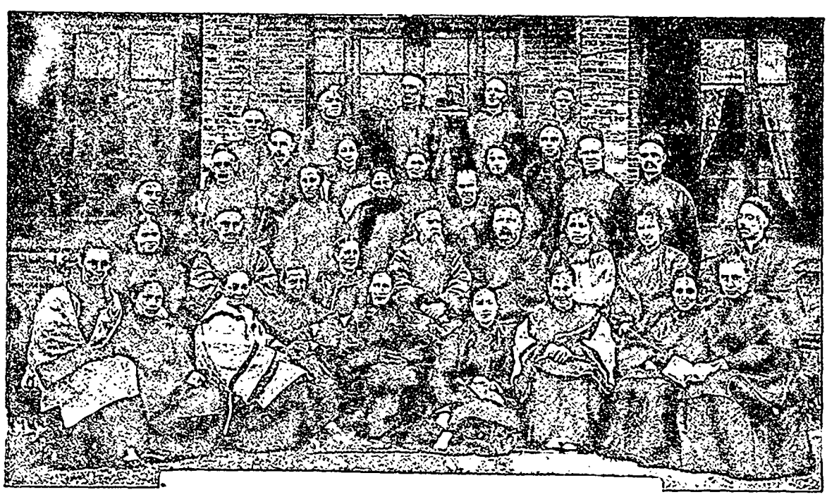
A GROUP OF CHINA INLAND MISSIONARIES FROM NORTH AMERICA

matters of church doctrine; it accepts both ordained and unordained men, both men and women, and single as well as married women; it uses persons of moderate as well as of better education, though it requires on the part of all its missionaries a thorough understanding of the foundation truths of the Scriptures, experience in Christian service, and a high spiritual development; it welcomes into its ranks those who have special training, such as teachers, physicians, and nurses; it requires its missionaries in the field to conform as far as possible and right to the outward habits of the Chinese, and, to this end, adopts the native dress and other customs; in its work it is largely evangelistic, its first desire being to bring an intelligible presentation of the gospel to "every creature" in China; it seeks to use unpaid native agents as far as possible in the development of its work in the field, holding that the missionary is chiefly responsible, after con-