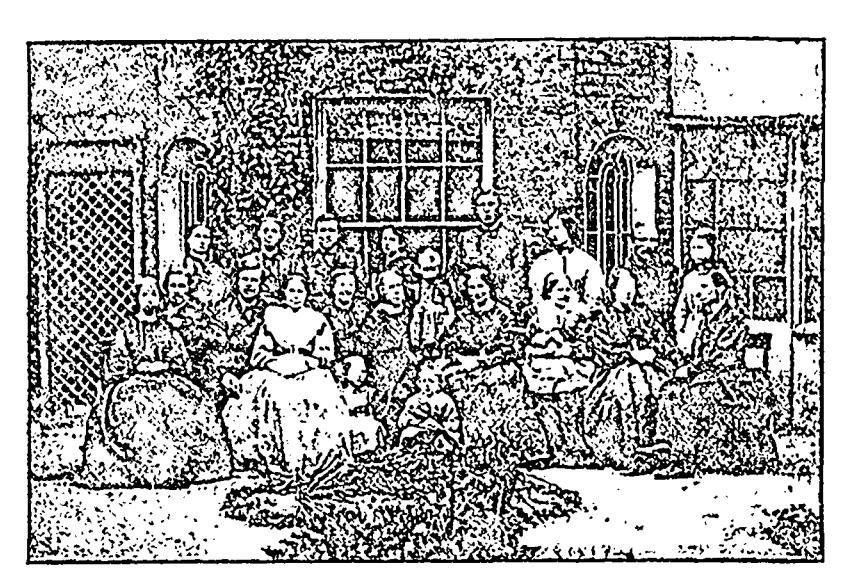
PARTY OF CHINA INLAND MISSIONARIES WHO LEFT ENGLAND IN 1866.

supply. Besides this, the majority of the workers are in the seaboard provinces, and out of those working inland, many are at treaty-ports, so that the great interior remains for the most part unreached. There are fully three hundred millions of persons in China, and the large majority of these have no more knowledge of redemption than would have been the case if no Redeemer had ever come to earth. There are over nine hundred walled cities where there is not a witness for Christ, and the smaller cities, towns, and villages in the same condition are almost beyond numbering.