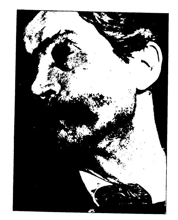
Fig. 1.—Barber saitch, superficial type.