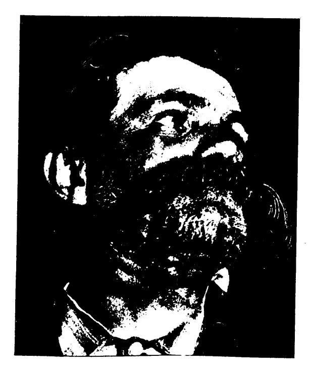
Fig. 3.--Barber's itch, classic nodular type.