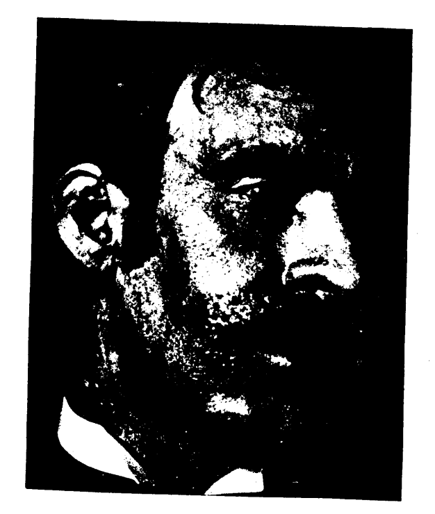
Fig. 2.—Barber's itch, medium type.