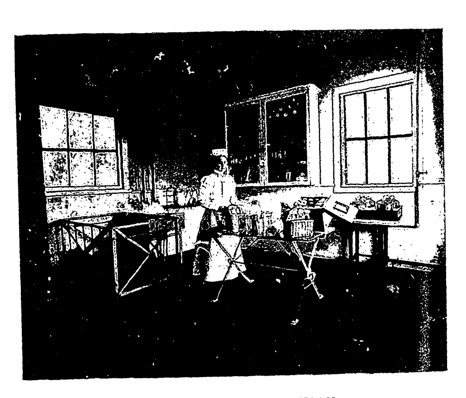
DENTONIA MILK LABORATORY

Showing apparatus for modifying milk. This room has tile side-walls, asphalt floor, glass table and shelves, and solid porcelain sink.