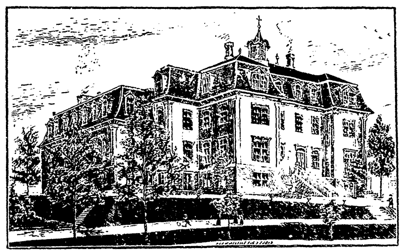
ANTIGONISH, N. S.

(Under the control of the Sisters of the Congregation de Notre Dame)