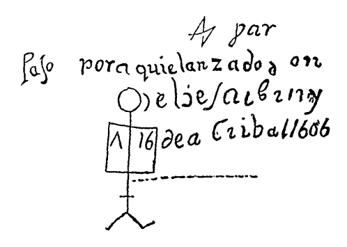
MORO INSCRIPTION : A.D. 1606.

and, it can scarcely be doubted, include inscriptions of the previous century.