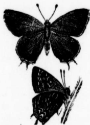
Fig. 5.— THECLA STRIGOSA , Harris, Eastern form.

Mr. L. E. Marmont, of Rounthwaite, Man., who has lived and collected in Manitoba for many years, writes: "I have only 9 specimens of your variety liparops of strigosa just now; but all have the large fulvous blotch on the fore wings. In one female it is fainter than the others, but quite noticeable; in another female the primaries are almost entirely fulvous with only a blackish border."