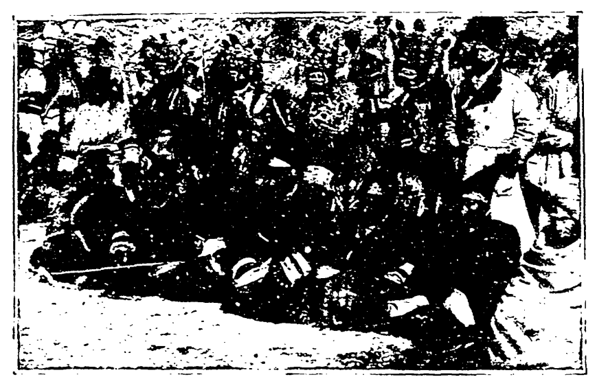
TIBETAN NOBLEMEN AND MASKED LAMAS, LADAK, TIBET,