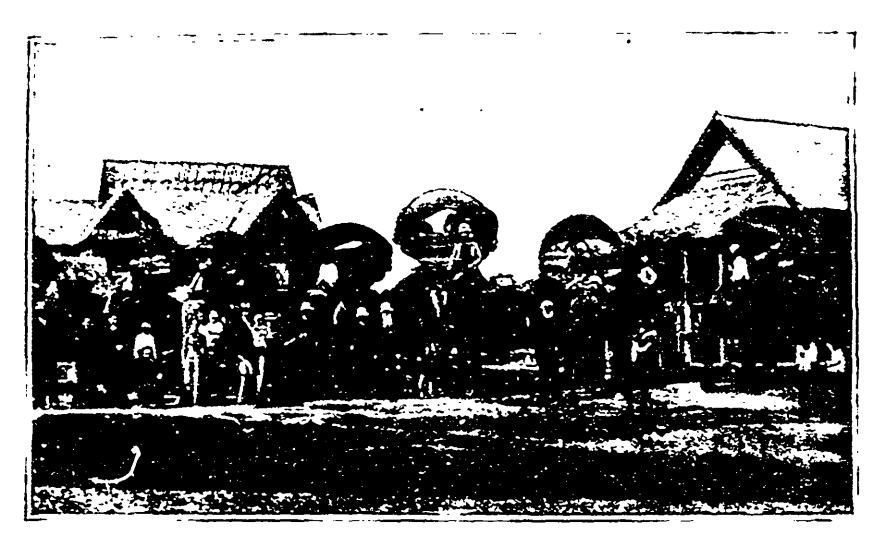
MISSIONARIES READY FOR DEPARTURE FROM LAKAWN TO THEIR STATIONS IN CENTRAL SIAM