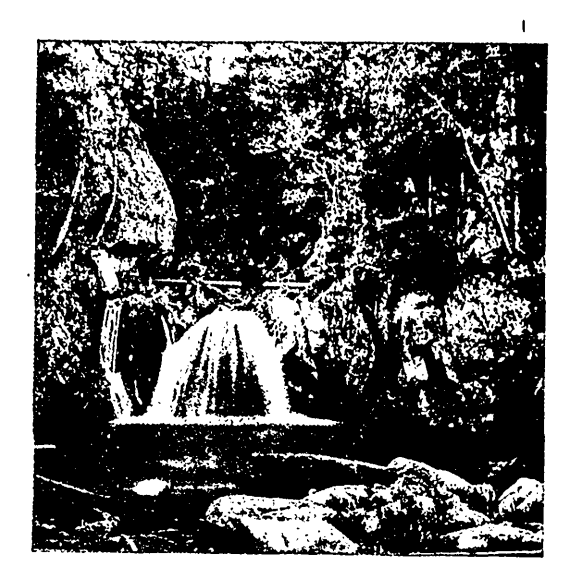
BRIDAL VEIL FALLS, NEAR WOLFVILLE.