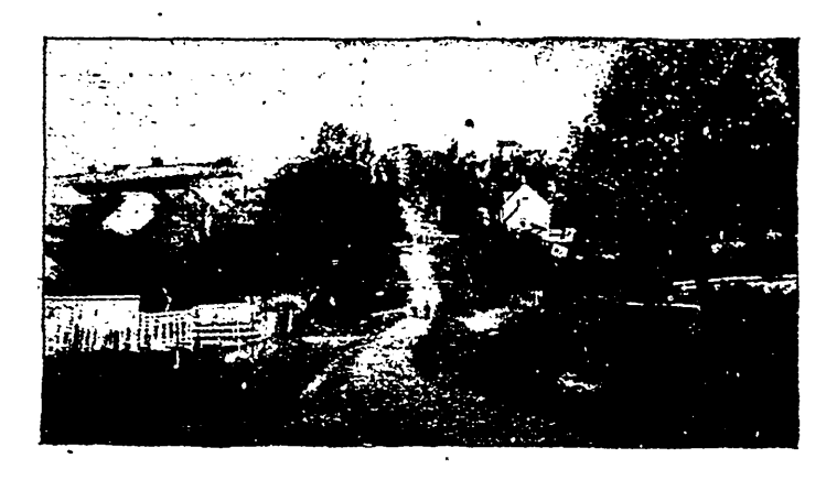
THE MODERN VILLAGE OF GRAND PRE.