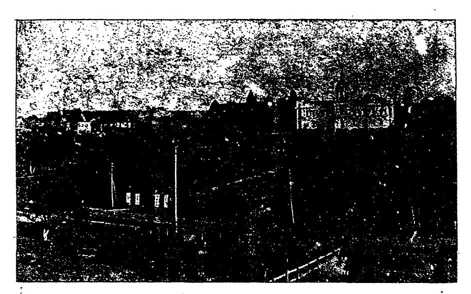
THE NEW COLLEGE.