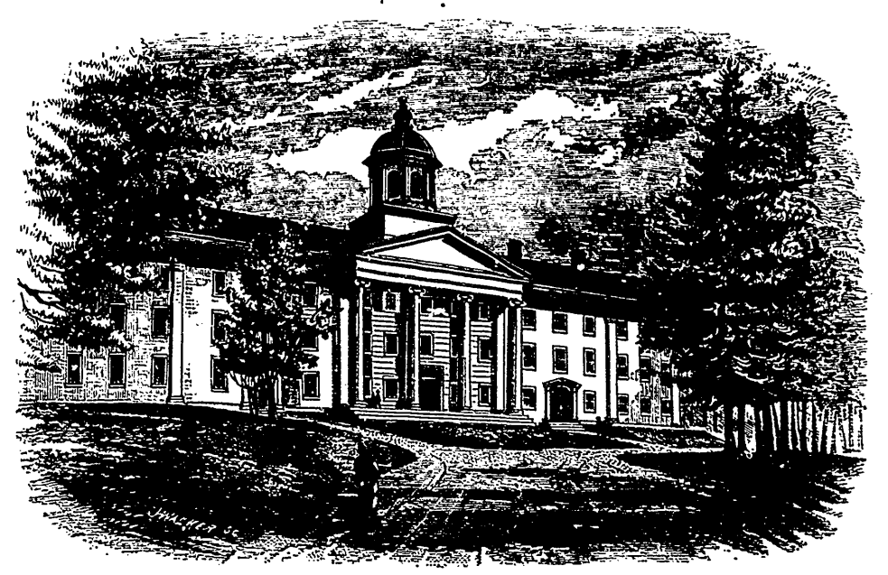
THE OLD COLLEGE.