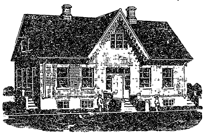
Residence, County of Mssisquoi.

The Government in the nomination of the honorary members of the above commission