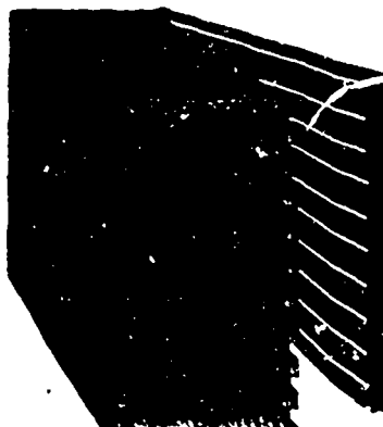
SECTION SHOWING PROCESS