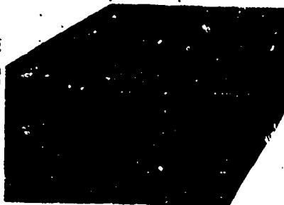
SECTION PATENT LUMBER