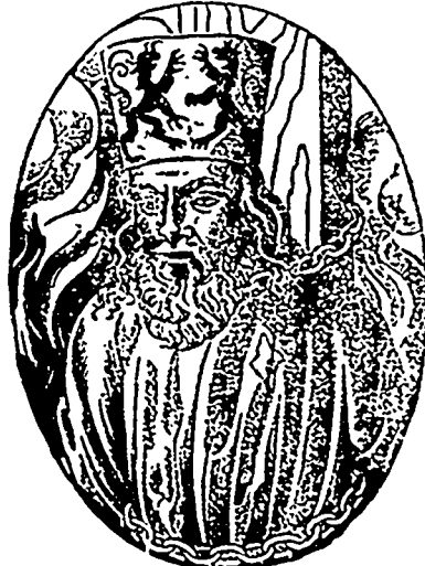
GEROME OF PRAGUE.

HALLAM'S HISTORY of the MIDDLE AGES. Complete, with all the Notes, in four small quarto, finely illustrated volumes, cloth, each 20c.; post., 10c.; per set, $1.75; in two vols., half Morocco, marbled edges, per set, $2.50; post., 40c. Now ready.