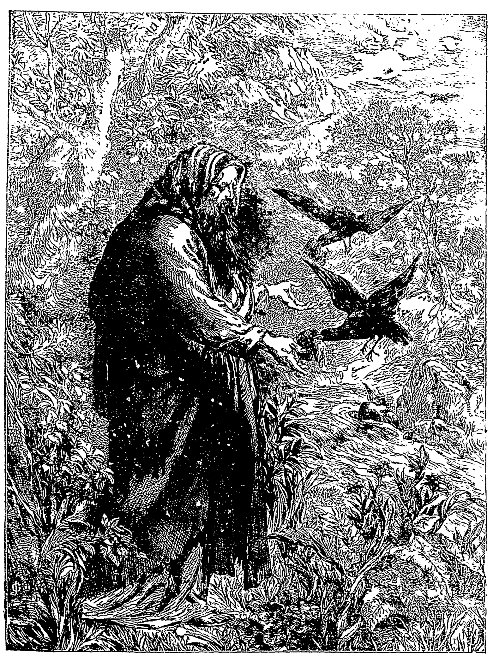
ELIJAH FED BY RAVENS.