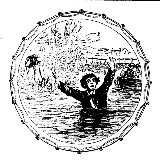
For the Sunday-School Advocate.