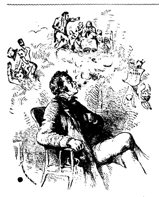
For the Sunday School Advocate.