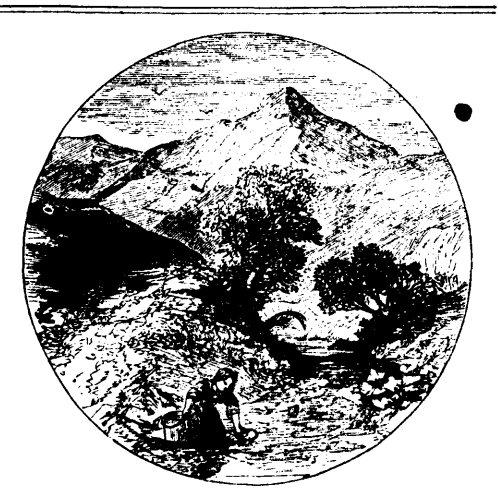
Selected for the Sunday-School Advocate.

IF we would not fall into things unlawful, we must sometimes deny ourselves of those that are lawful.