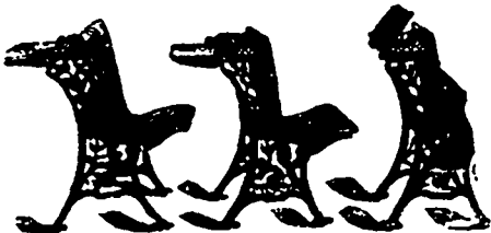
THE "MARVEL" SCHOOL DESK,

W. STAHLSCHMIDT & CO., PRESTON, ONTARIO. Manufacturers of Office, School, Church and Lodge Furniture.