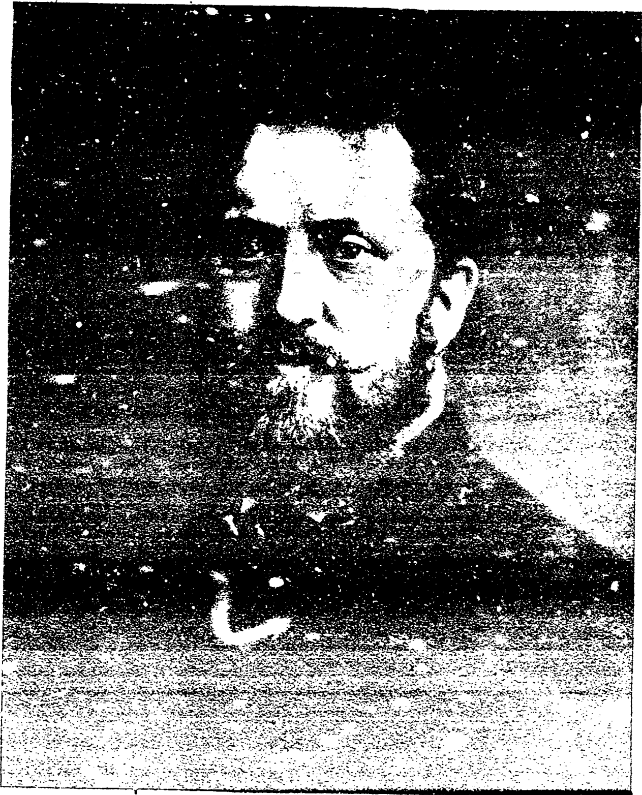
HIS EXCELLENCY THE GOVERNOR-GENERAL OF CANADA.