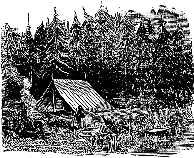
INDIANS GATHERING RICE.

ten days, when it is let off, and a fresh supply admitted, which remains until it becomes necessary to dry the earth for the second hoeing, and this process is repeated until after the third or fourth hoeing, when the water remains until the grain is fit for harvest. The Zizania , or Wild Rice—properly an aquatic grass; Nuttall mentions the species found in the United States, viz, the Zizania Miliacea , Zizania Fluitans , and the Zizania Aquatica , which last is found in great profusion in that charming body of water, which has received the appropriate and pleasing appellation of Rice Lake.