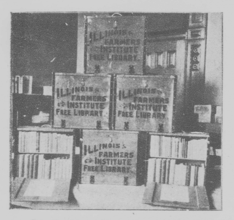
Travelling Library Illinois Farmers' Institutes.

"The travelling libraries have carried into hundreds of homes new thoughts and information, higher aspirations and ideals, new forces that are making for a better individual, family, and social life. books are warmly welcomed by fami-