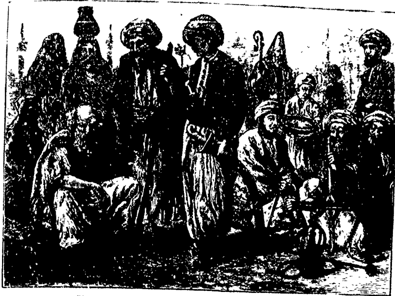
NATIVE TYPES IN MODERN PALESTINE.