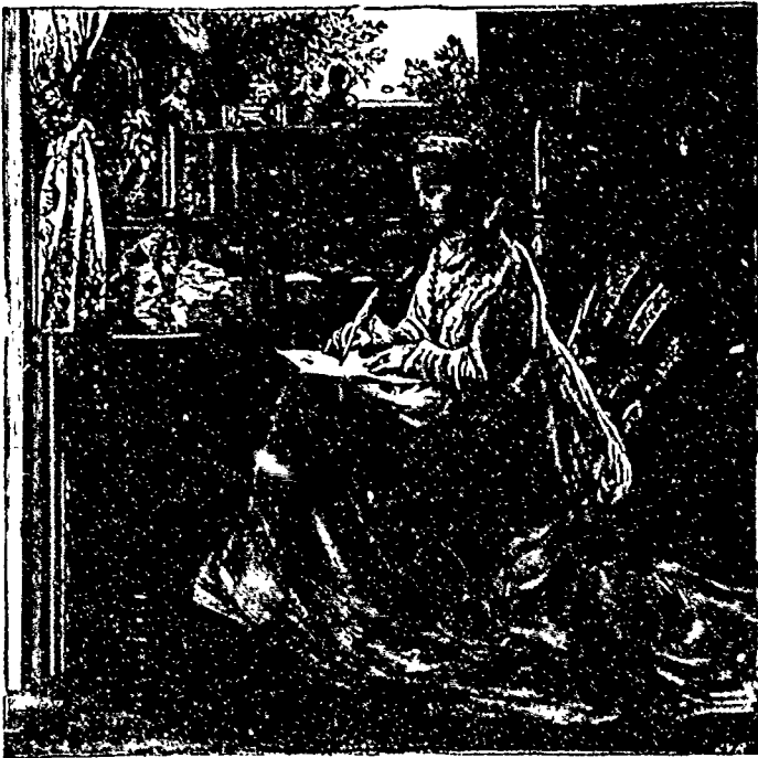
HOW THE JOURNAL WAS WRITTEN.