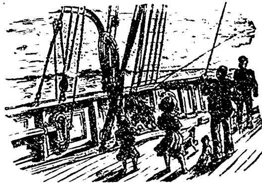
THE CHILDREN WANT TO GO UP, TOO.