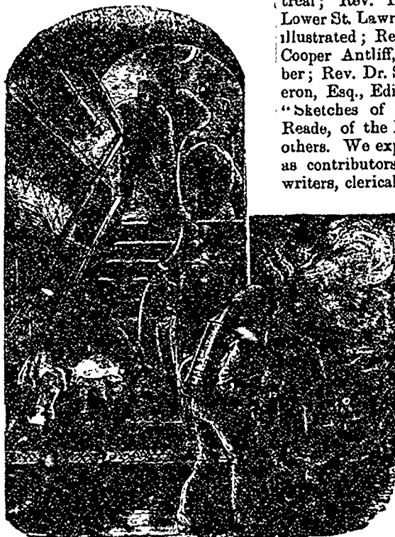
THE YACHT ON FIRE—HOW THE CHILDREN WERE SAVED.

plums of New York, which have attracted so much attention, will be given; and several illustrated papers on Foreign Missions by the Editor. We shall also give a reprint article by James Anthony Froude, on "Great Britain and Her Colonies," one by Phillips Brooks, on "The Pulpit and Skepticism;" and if space will permit, articles by the Right Hon. W. E.