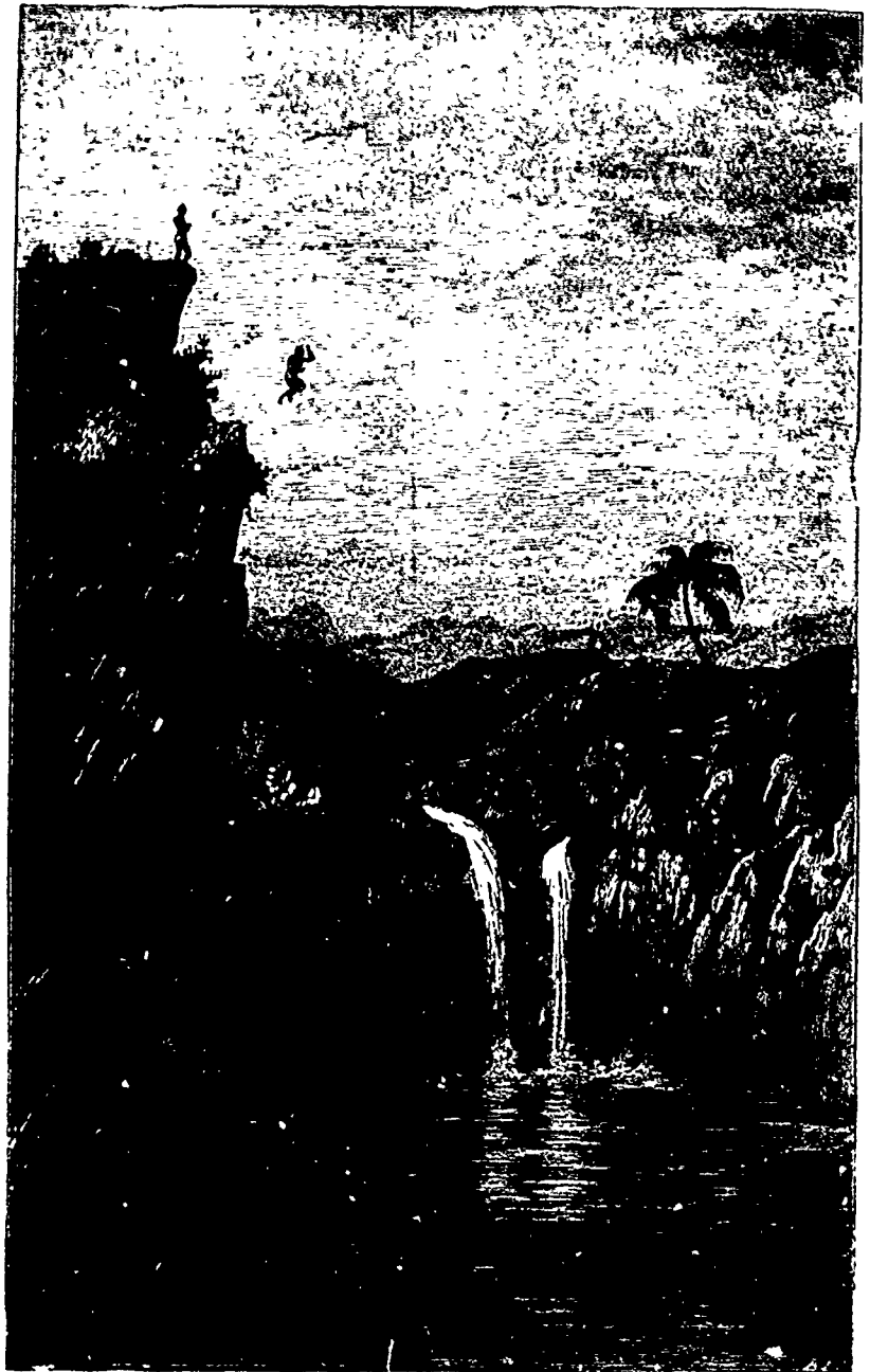
HIGH LEAP AT HILO.

Price, two cents a quarter, or eight cents a year.