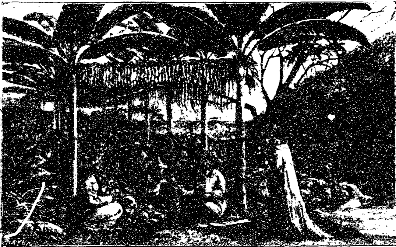
A NATIVE PICNIC AT TAHITI.

Specimen of 118 cuts which will appear in the "Methodist Magazine" during 1884.