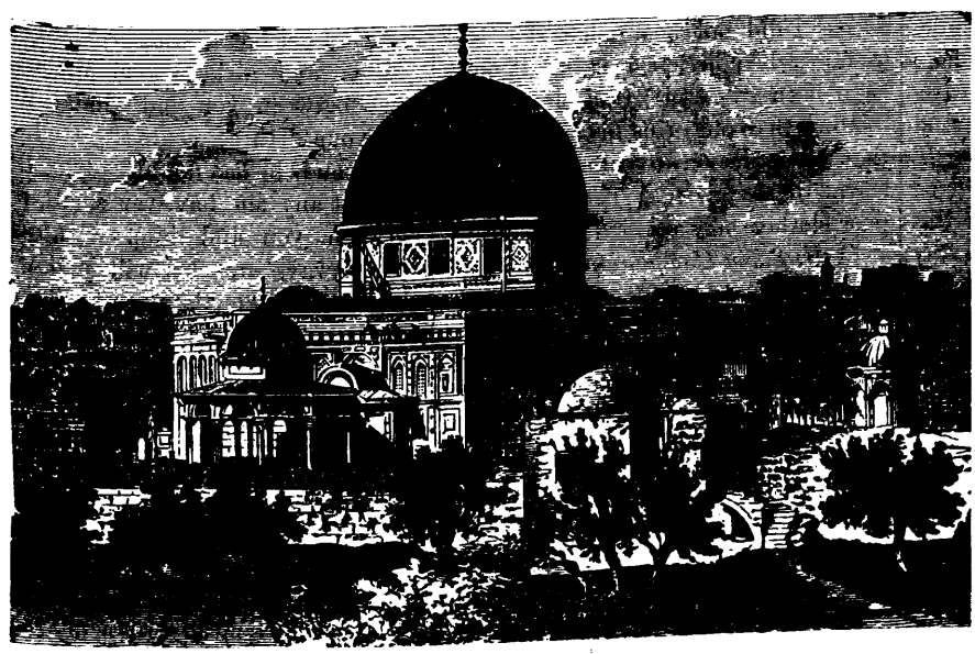
THE MOSQUE OF OMAR.