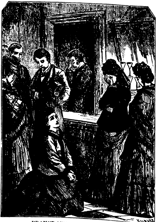
PRAYER-MEETING IN A SALOON.