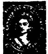
9. 7 1/2p GREEN.

the letter rates per ½ oz. to the United Kingdom were reduced to 10d. via Cunard packet and 7 1/2d. via Canadian packet in 1854, the public did not have the convenience of a 7 1/2d. stamp until Aug. 1, 1857. On this date a 1/2d. stamp was also issued.