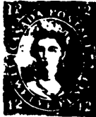
3. 12p BLACK.