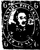
2. 6p PURPLE.