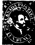
7. 10p BLUE.

lilac in color, and bears the picture of the Prince Consort. The 12d. is black in color and bears the picture of the Queen. Only about 1,500 of this last stamp was issued, and it is, consequently, the rarest and most expensive of all the Canadian stamps, a perfect specimen being worth from $400 to $500. The manner in which the value is expressed on it is not an error, as might be supposed, from its being officially called a "shilling." There were shillings of different values in circulation in various parts of the colony, and to more definitely describe the value of it "twelve pence" was used instead of "one shilling." This last stamp was withdrawn when the 10d. stamp was issued December 5, 1854.