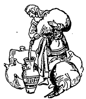
Eastern Water Skins

is very plain. He has just to forsake his way; give up all that is evil in his life. and also in his thoughts-we must go deep into our heartsand return unto the Lord; resolved to love and obey Him. And what will God do 7 Ob. His forgiveness is so full and free! Abund-