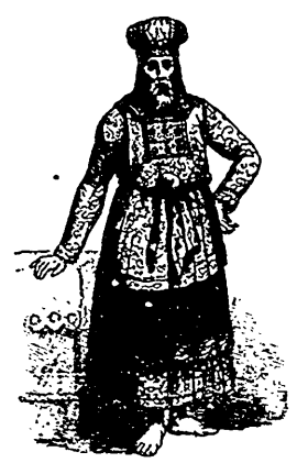
A High Priest]

Time and Place -622 B.C.; the temple and king's palace at Jerusalem.