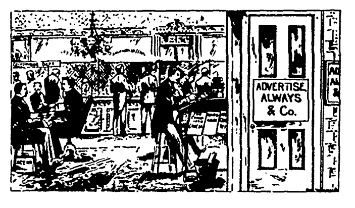
Signs of Wealth, Boss alert, Clerks at work, None inert. Lesson take, Every man Advertise All you can.

Write us for sample copy and card of advertising rates.