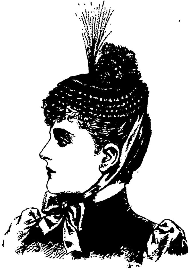
PLATE NO 1.

This old established and popular firm have been making extensive preparations for their spring opening, and their large and commodious premises begin to look bright and cheerful with their new importations which have been arriving daily. They report that the bulk of their stock is now to hand, and they have everything in shape for their visiting customers. Travellers orders have been placed on a liberal scale, and altogether the prospects are much better for a good millinery season. They state that flowers will be 'ery much worn during the coming season, and there is every indication of its being a better. Iace season than the last. Ribbons are shown as largely as ever. Hats are again with wide brims and low crowns. Very few plain goods are being shown, all being mostly fancy braids. Leghorns will be much in demand for the coming season and bonnets will be again small.