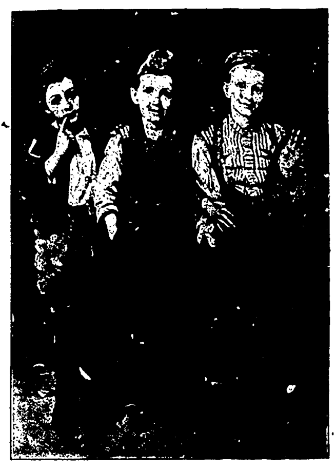
"ARE YE WID US?"