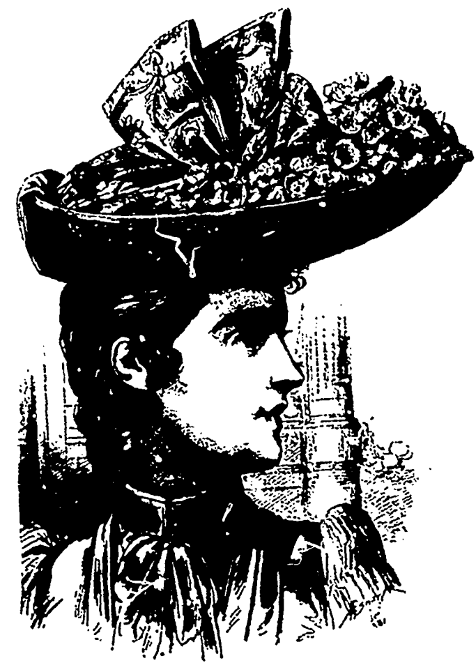
PLATE NO. 3.