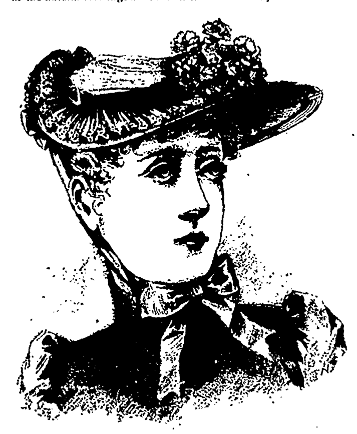
PLATE NO. 2.

While velvet flowers are recommended for the early season, the lovely silk and muslin designs will be worn later. Wreaths, graceful sprays and bunches are all seen, and the violet, rose, daisy, chrysanthemum, morning-glory, forget-me-not, pansies and other wild and rarely cultivated blossoms, are of every hue and combination, as the natural colorings are by no means consistently followed.