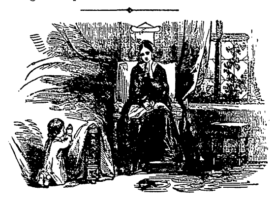
A STORY FOR LITTLE CHILDREN.

There was a little boy who heard, one Sunday, a clergyman preach. The text which the clergyman read was: "Verily, verily, I say unto you, whatsoever ye shall ask the Father in my name, he will give it you."