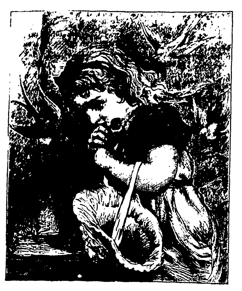
A CHILD WHO CHARMED BIRDS.

THERE is a little girl in Ohio, five years old, who has the power of charming birds the exercise of this strange power,