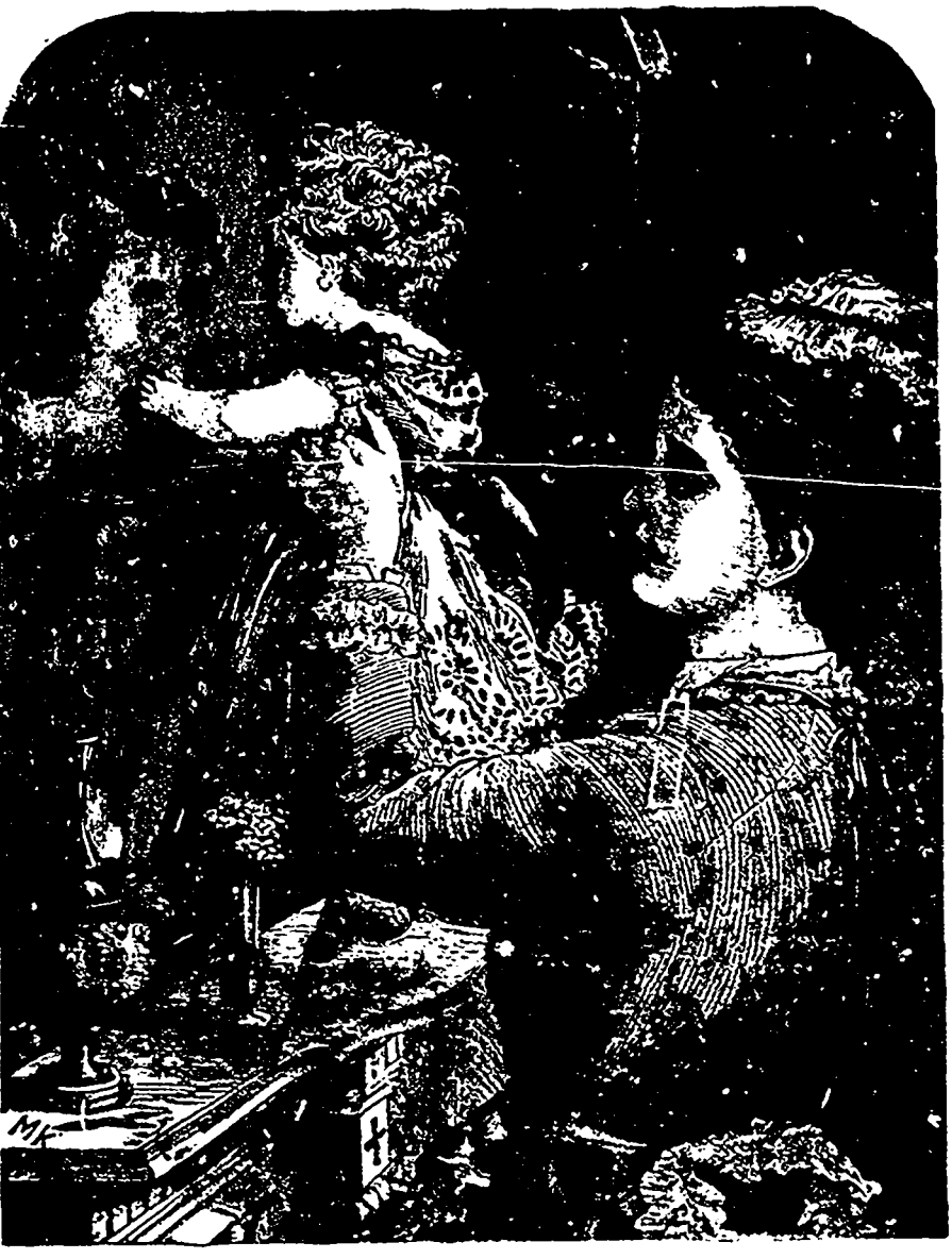
WHAT THE LOOKING-GLASS SAID TO THE BABY.

utiful fairy ' her hand white as snow, ts all the wonders this wide world can show.