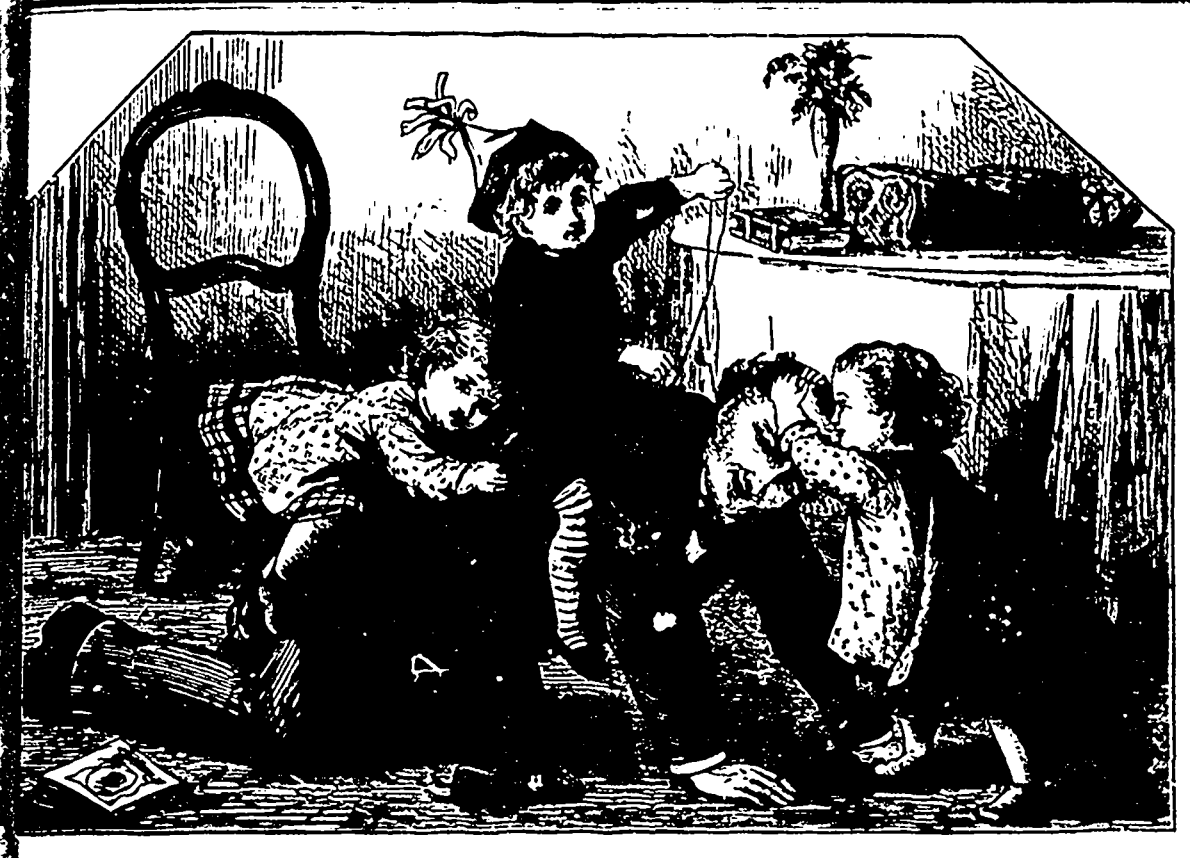
THE EVENING ROMP.