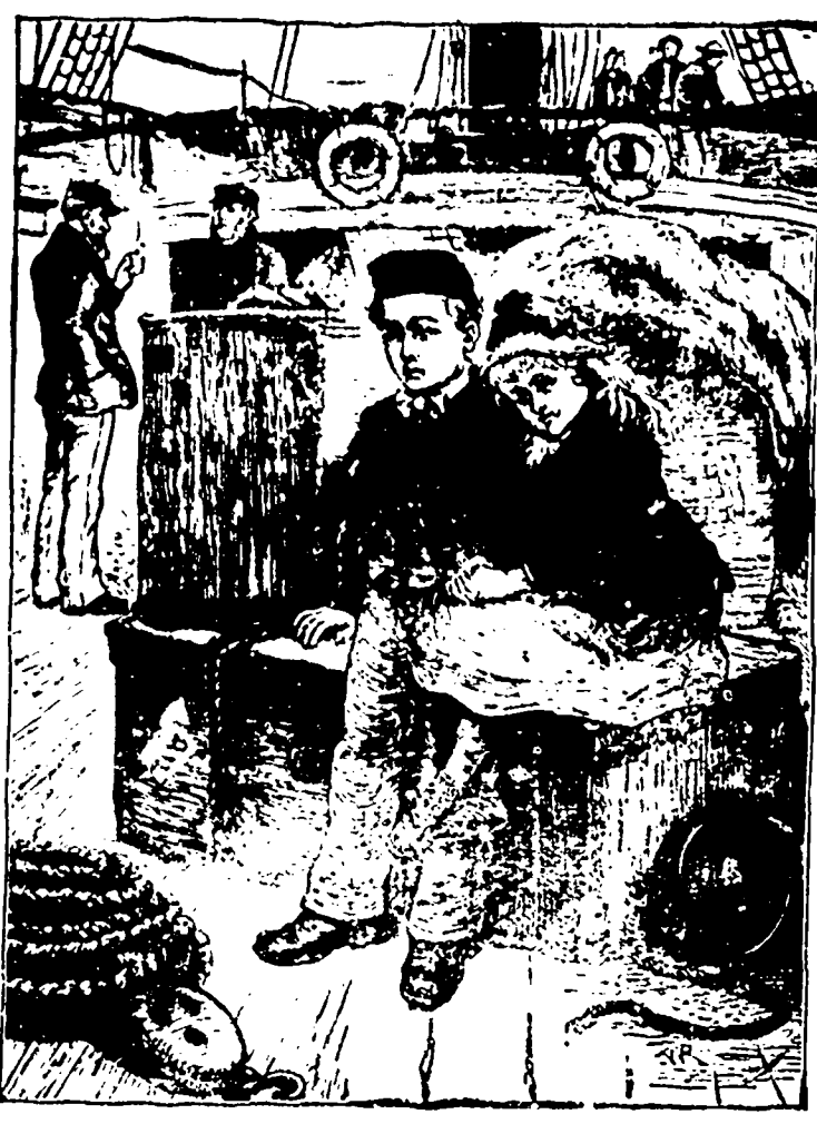
THE YOUNG EMIGRANTS,