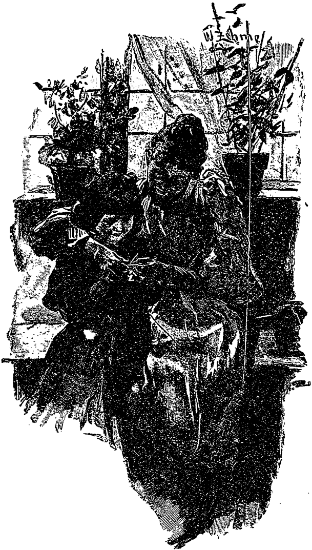
THE KNITTING LESSON.—(See third page.)