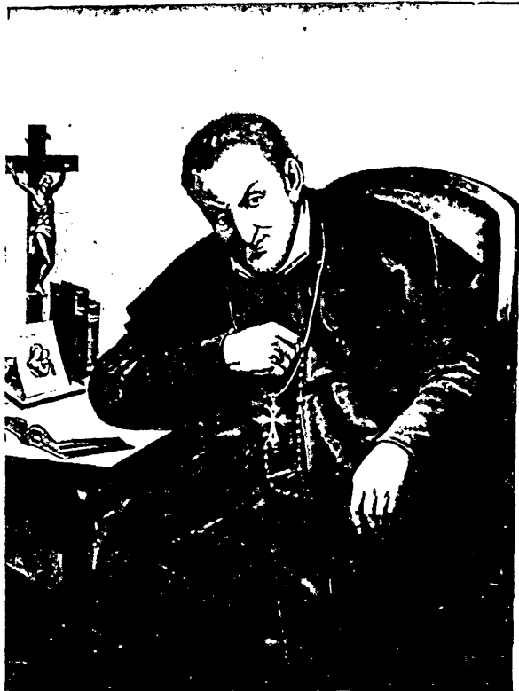
ST. ALPHONSUS LIGUORI.