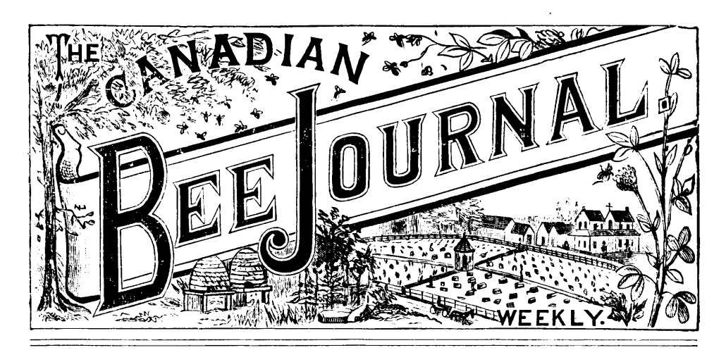
"THE GREATEST POSSIBLE GOOD TO THE GREATEST POSSIBLE NUMBER."