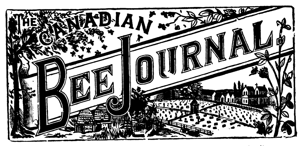
"The Greatest Possible Good to the Greatest Possible Number."

Vol. VIII, No. 12. BEETON, ONT., SEPT. 15, 1892. WHOLE No. 320