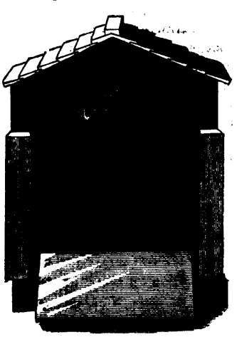
EXTERIOR VIEW OF HILTON CHAFF HIVE.

The outside is made of § lumber, two feet long. the ends nailed on the sides, making outside dimensions about 24x25 inches. This leaves the side walls 6 in. thick, and end walls 4, to the top of brood nest. There it is decked over flat, allowing the whole upper part to be used for surplus. For extracting, I use a super holding 14 frames; and for comb honey a crate similar to the Heddon, only it holds forty I pound sections, or thirty 11 pound sections, and can be tiered up, and the cover will shut over all. leaving an air-space all around.