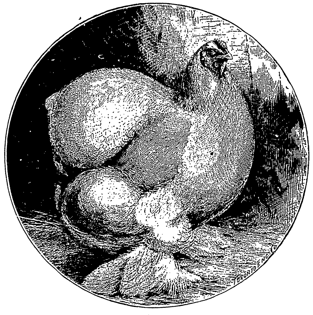
BUFF COCHIN PULLET. First at Crystal Palace and Birmingham, 1891. Sold for $100.