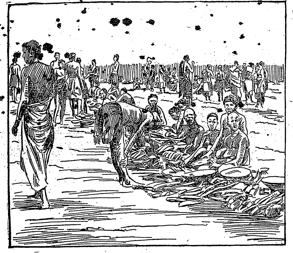
A CONGO MAFKET.

If we have moved into a new town, and entered into new church relations, we should count ourselves in, and let the people know we belong to them by our presence at the Sunday and week-night services by our evident interest in their various undertakings, and by our willingness to go halfway to receive recognition and greeting. Such a 'count-me-in' spirit is not offensive or presumptuous, believing itself equal to everything, and failing to recognize its limitations. It is rather the spirit 'that vaunteth not itself, is not easily provoked, thinketh no evil.' It is like unto the spirit of him who 'came not to be ministered unto, but to minister.'—'S. S. Times,' London.