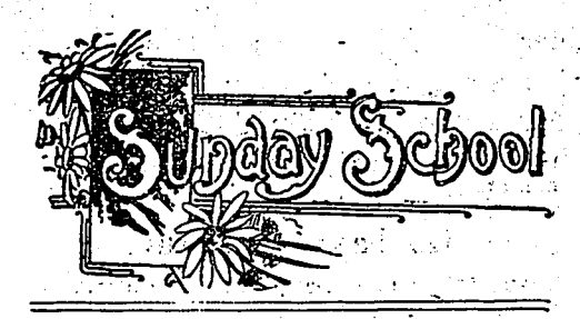
LESSON I.—OCTOBER 14.