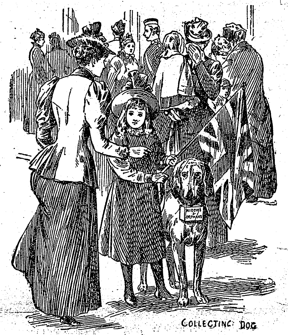
A RECENT SCENE OUTSIDE THE WAR OFFICE IN LONDON.