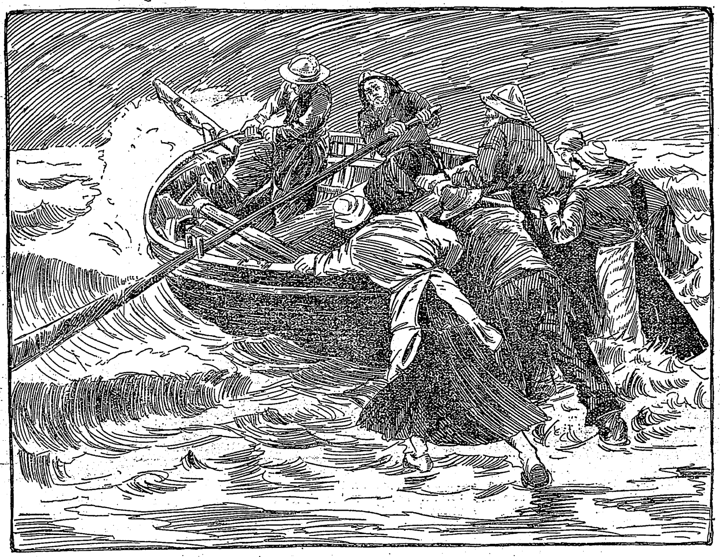
A BOAT WAS ALREADY BEING LAUNCHED TO THE RESCUE