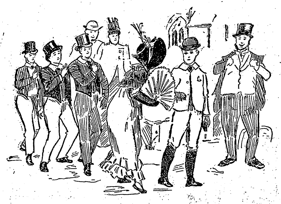
SKIP SHOWS THAT THE DAYS OF CHIVALRY HAVE NOT ALTOGET-HER GONE BY

It all came to pass as they expected. After each of the boys had got through a sep-