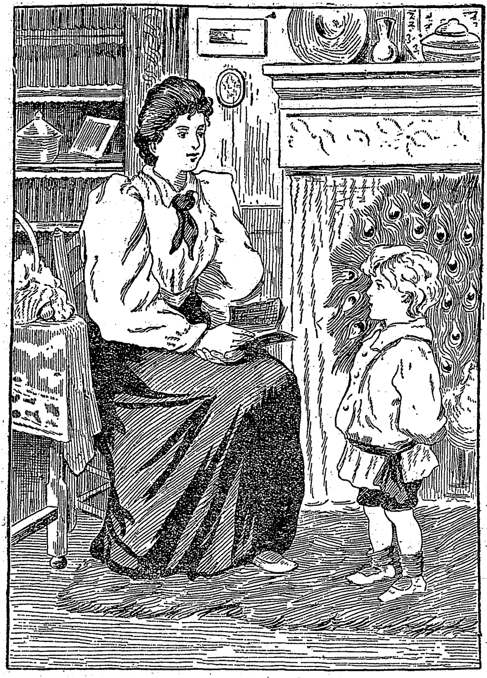
A MORNING HYMN.

At first all was dark, and she was about to run away, when she spied a chest in the corner, and her curiosity led her forward. As her eyes became accustomed to the gloom, she could see quite plainly. Opening the lid of the iron chest, she peeped in, and to her delight saw numbers of little drawers inside. She opened one after the other, until she came to the last one, which was somewhat larger than the others. When she opened this one there were two little ones inside of