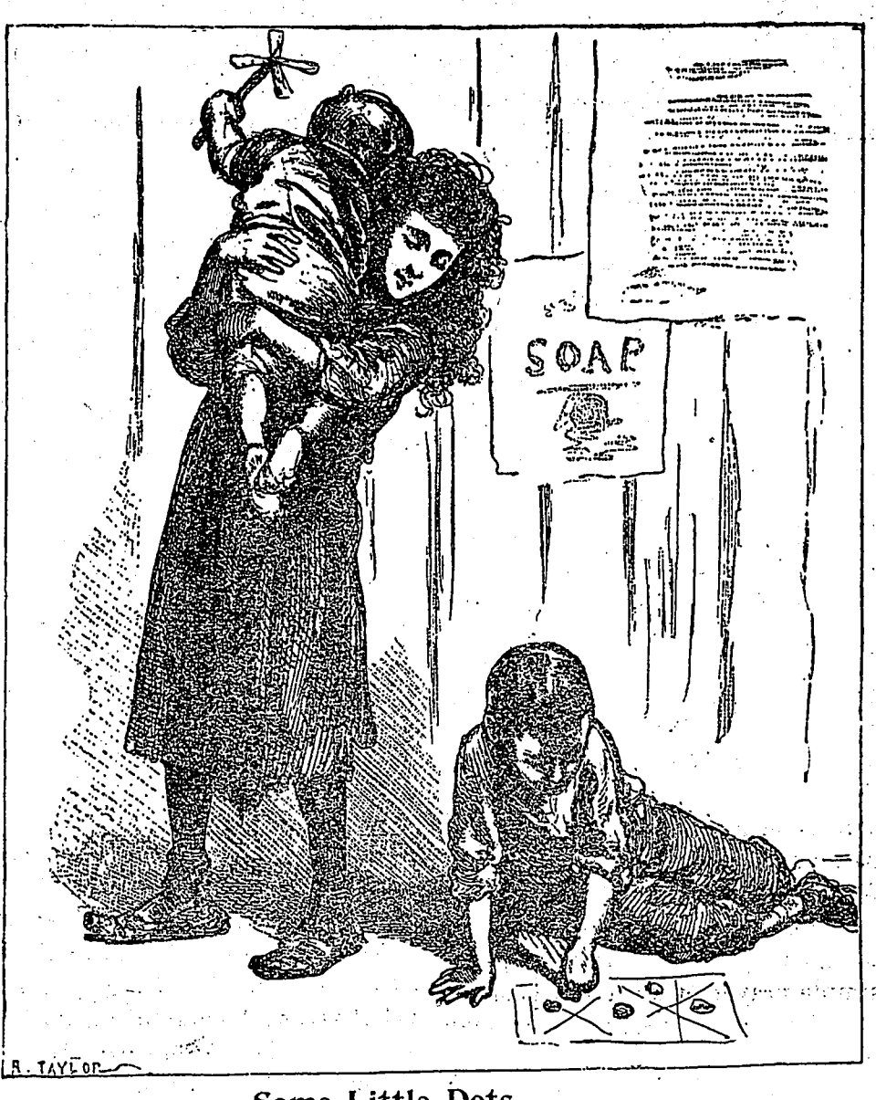
Some Little Dots.

But, alas! the rude Turkish woman sent the poor widow away without either thanks or pay for her service.