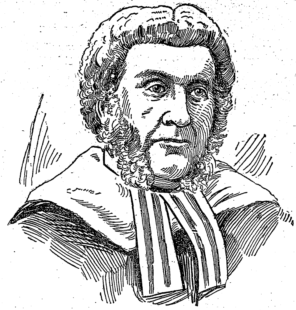
THE LATE HON. MR. JUSTICE GROVE.

The tobacco product of the United States from the census of 1880, is 472,661,159 pounds, taking 638,841 acres to raise it. The amount spent for tobacco in the same country annually is $600,000,000. In the city of Chicago $24,500 are spent for cigars alone in one day. At seven percent, compound interest, if you use one cent's worth of tobacco a day for thirty years, it will cost you $344; at five cents a day it will cost you $1,-