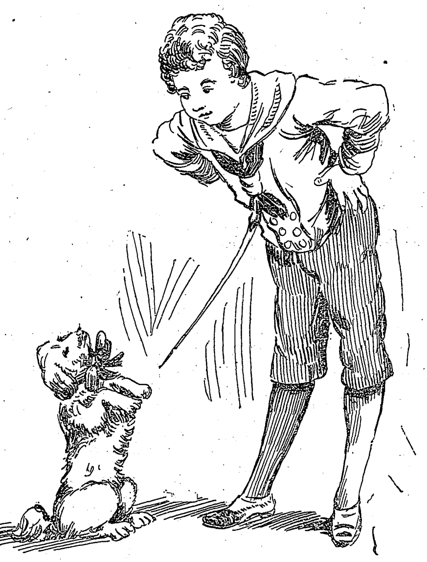
'SPEAK, FIDO,' COMMANDED JAMES.

'That's so, mamma; I'll try after this not to want to run away from things I don't like to do. I couldn't really run away from speaking Fido shook his head, and James the piece, because you would not