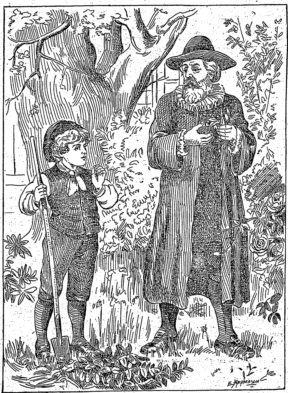
THE PASTOR TOOK THE PLANT.

Then he went on to the college in the same town, but he was found to be sadly backward in the studies necessary for a