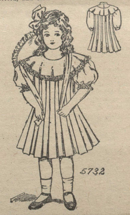
NO. 5732 .- A DRESS FOR THE LITTLE MAID.

In ordering patterns from catalogue, please quote page of catalogue as well as number of pattern, and size.