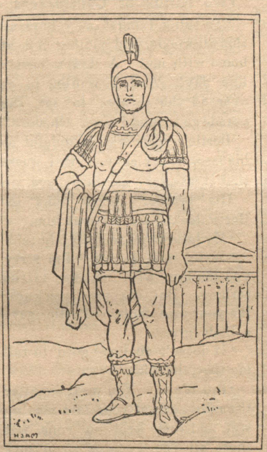
WHAT DOES THE BIBLE SAY ABOUT SOLDIERS?

wouldn't go. See by the moonlight it's half-past midnight, time kid and I were at home an hour and a half ago. Went along a little farther and came to a stick. Pray, stick, whip kid, kid won't go. See by the moonlight-"