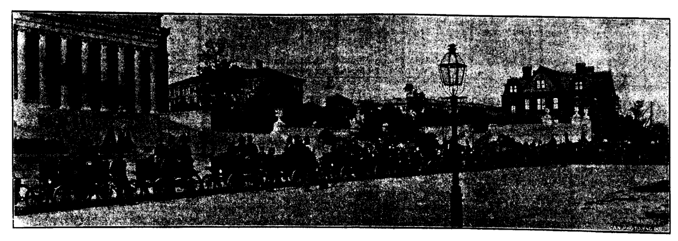
Horseless Vehicle Parade at Columbia College, New York.

Few questions in the field of electric lighting are of greater importance to central station managers than that of the efficiency of incandescent lamps, and few questions seem so thoroughly misunderstood, and yet the fault is not entirely with the central station. In the first place, only the larger companies will invest in the necessary apparatus, and surprisingly few of these will purchase enough apparatus to determine the efficiency of their lamps. The initial outlay, including photometers and instruments, will more than pay for itself in the first year. In the absence of the proper outfit, the managers have to depend upon